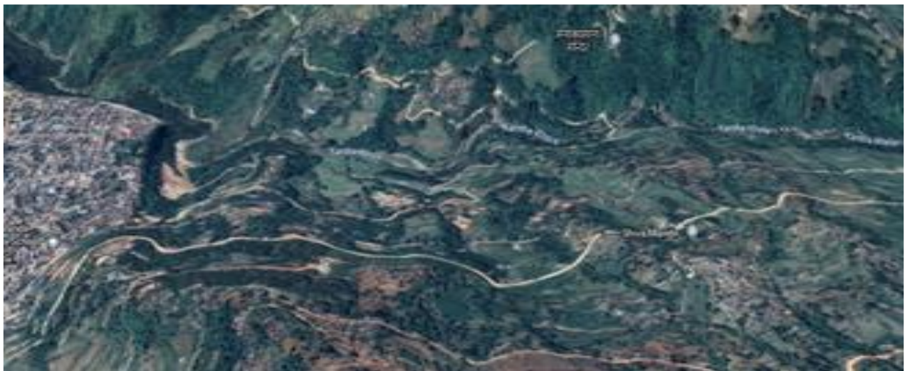
Fig. 1 Map Showing the Study Area